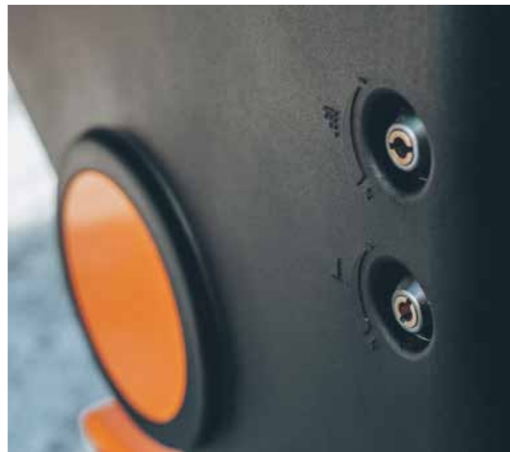
bottom left: kugelmann screw conveyor bottom right: manual adjustment of spread width/density

MAXIMUM PAYLOAD center of gravity close to vehicle low net weight