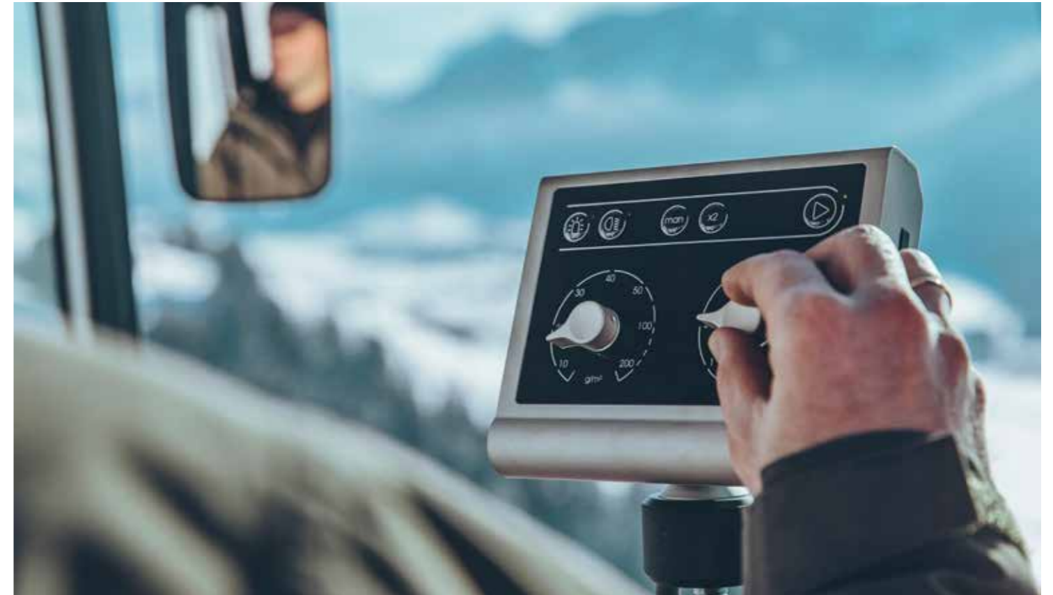
Control system K-BASIC 2

A unique feature of our spreaders is the infinitely adjustable spread pattern. Even more convenient by means of electronic adjustment or even through dynamic stabilisation of the spread pattern.