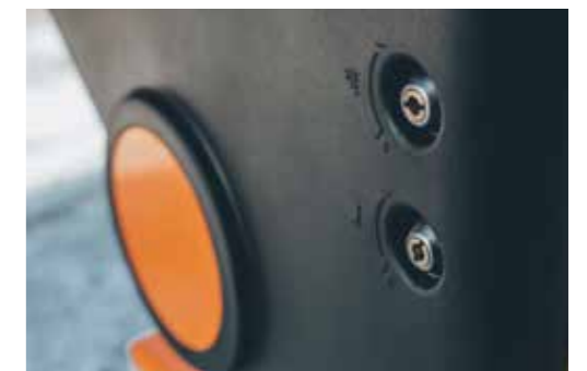
Side cover D601

Optionally, the K-BASIC 2 or the K-TRONIC 2 may be ordered as „remote control unit“ or may be refitted.