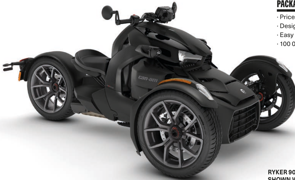
RYKER 900 SHOWN WITH INTENSE BLACK PANELS