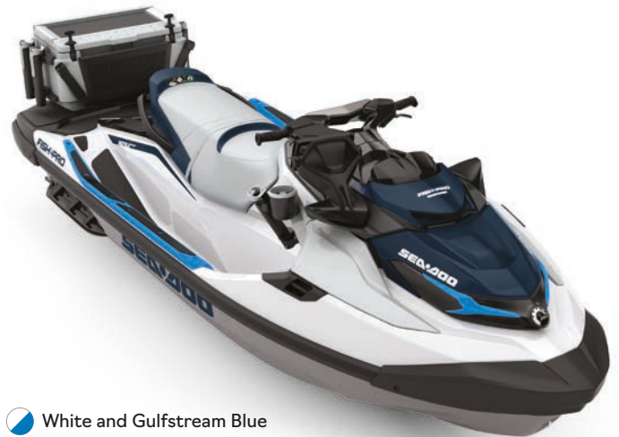
White and Gulfstream Blue