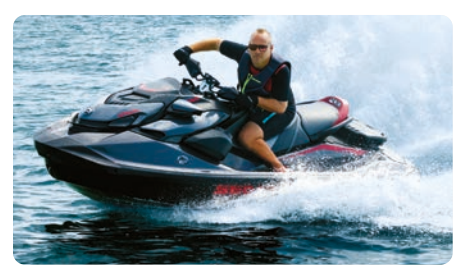
Ergolock™ Two-Piece Racing Seat Tacky surface, back support enhances grip during aggressive riding.