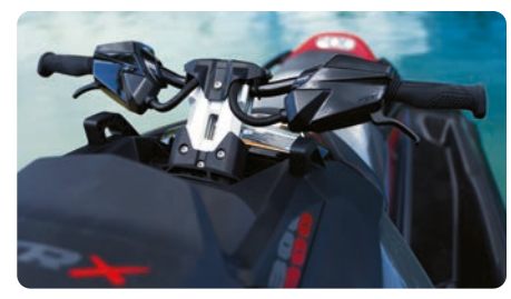
Low-Rise Handlebars Creates a more streamlined, race oriented riding position.