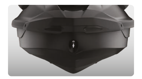
GTI™ Hull This moderate V-shaped hull guarantees a stable, enjoyable ride in variable water conditions. Confident, predictable handling but incredibly playful when you want it to be.