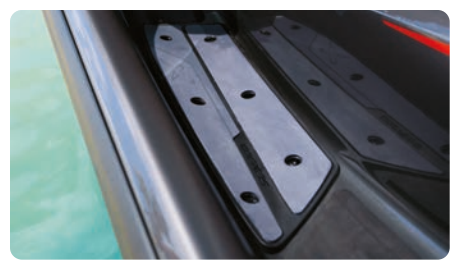
Angled Footwell Wedges Lined with premium carpets, provides superior foot grip.

©2023 Bombardier Recreational Products Inc., (BRP). All rights reserved. ®, TM and the BRP logo are trademarks of Bombardier Recreational Products Inc. or its affiliates. All product comparisons, industry and market claims refer to new sit-down PWC with 4-stroke engines. Watercraft performance may vary depending on, among other things, general conditions, ambient temperature, altitude, riding ability and rider/passenger weight. Testing of competitive models done under identical conditions. Because of our ongoing commitment to product quality and innovation, BRP reserves the right at any time to discontinue or change specifications, price, design, features, models, or equipment without incurring any obligation. †Garmin is a trademark of Garmin Ltd. or its subsidiaries.