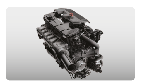
Rotax® 1630 ACE™ - 300 Engine The powerful Rotax® 1630 ACE™ - 300 engine levels up your performance to your liking by delivering high efficiency and a world-class acceleration.