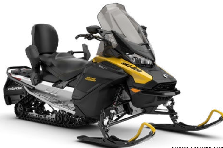
GRAND TOURING SPORT 600 ACE SHOWN

Trail comfort and 2-up features with precision handling and savvy style.